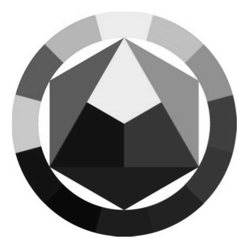
Fig. 5. Scale diagram of main color system

In this research, the clustering analysis of gray image is mainly based on Kmeans algorithm. The advantages of the adopted K-means clustering algorithm are mainly concentrated in: the algorithm is fast and simple; for large data sets, it is more efficient and scalable; the time complexity is near linear, and it is suitable