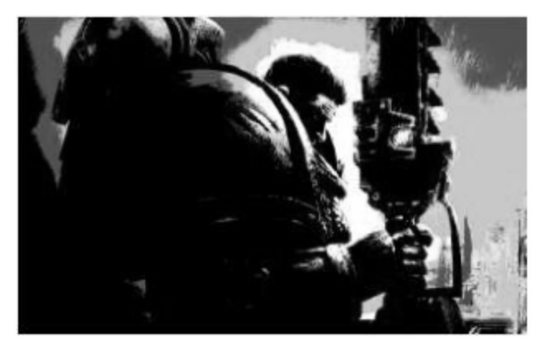
Fig. 4. Clustering renderings

Figure 4 shows the rendering. Through repeated test experience accumulation, the six color areas affected by the color proportion in the color block were analyzed according to the lightness, temperature, hue and brightness of the color. An influence color interval was constructed, so as to store the pixels in the six color zones that can ultimately affect the results of the behavioral analysis. And then these six color areas were counted. When the proportion of pixels in a color area exceeded the specified threshold (this threshold was a range of behavior color distinction boundary summed up after repeated trials, pictures, analyses, calculations), the proportion was saved in the influence color interval (Zhang et al. 2011) [14]. Figure 5 shows the proportion of dominant colors.