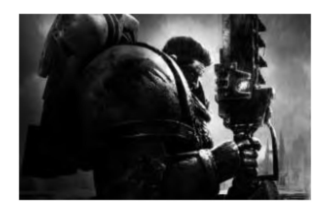
Fig. 2. Original drawing obtained by the computer

Figure 3 shows a partial chromatic graph of a partition. According to the color image, all pixels were planned into 14 color blocks. After that, all pixel points were traversed and incorporated into class groups. The pixels of the same class were rendered to the same color.